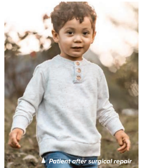
▲ Patient after surgical repair

Pierre Robin sequence can be an incredibly emotional diagnosis, and the initial hospitalization can be extremely stressful for families. However, with multidisciplinary care, our goal is for every child with Pierre Robin sequence to do well and live as normal a life as possible.