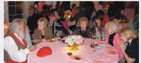
Guests enjoy October's lively Toast to a Cure event, which supported breast cancer research and treatment.