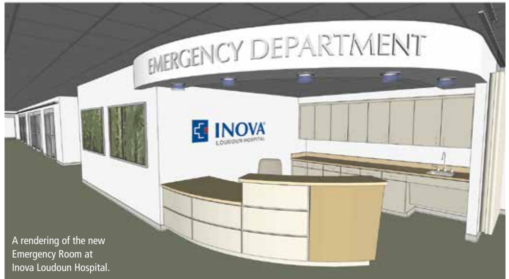
A rendering of the new Emergency Room at Inova Loudoun Hospital.