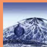
Tumor bed after removal