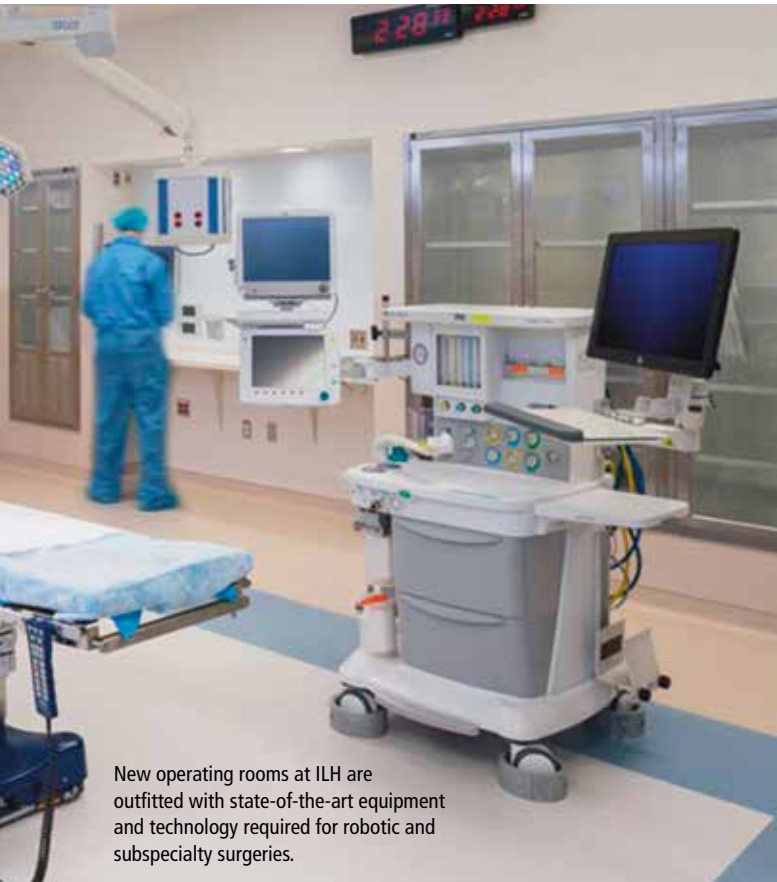
New operating rooms at ILH are outfitted with state-of-the-art equipment and technology required for robotic and subspecialty surgeries.

With the arrival of new colorectal specialists and the addition of a new endoscopy suite, patients can now receive advanced digestive services for a wide range of conditions without needing to travel outside of Loudoun County. And, with the addition of neurosurgeons, the hospital can treat conditions such as normal pressure hydrocephalus (NPH).