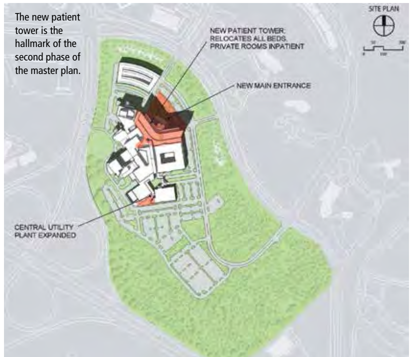
The new patient tower is the hallmark of the second phase of the master plan.