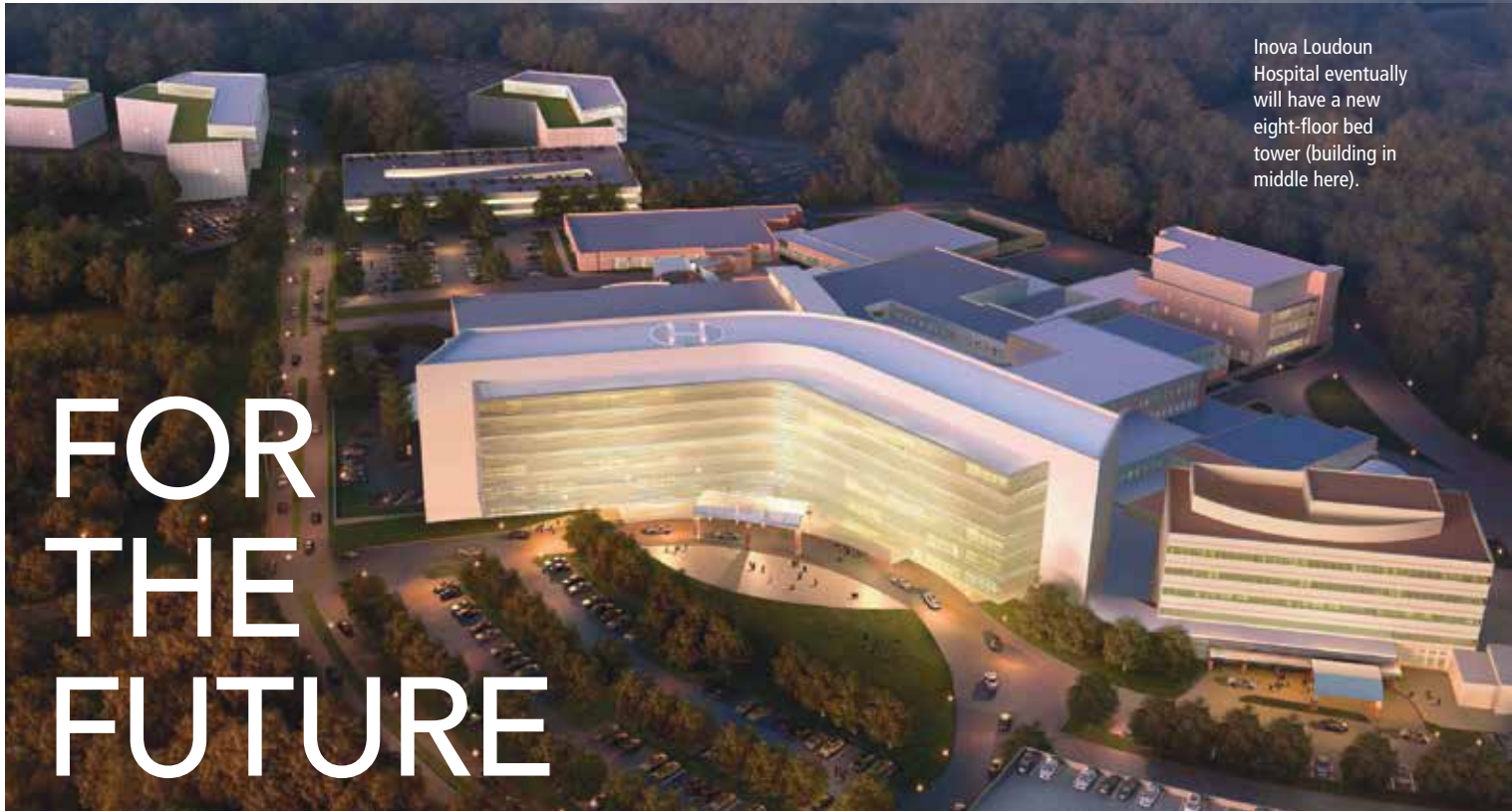
Inova Loudoun Hospital eventually will have a new eight-floor bed tower (building in middle here).