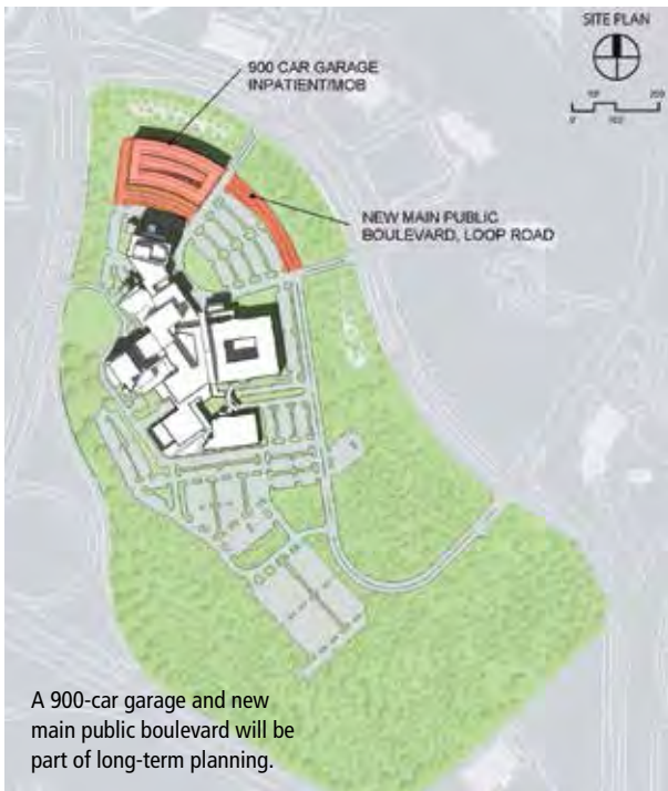
A 900-car garage and new main public boulevard will be part of long-term planning.